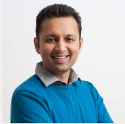
Founder & CEO, Infinitus